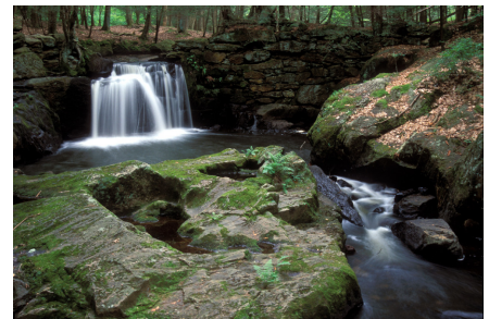
Salmon River Watershed Partnership